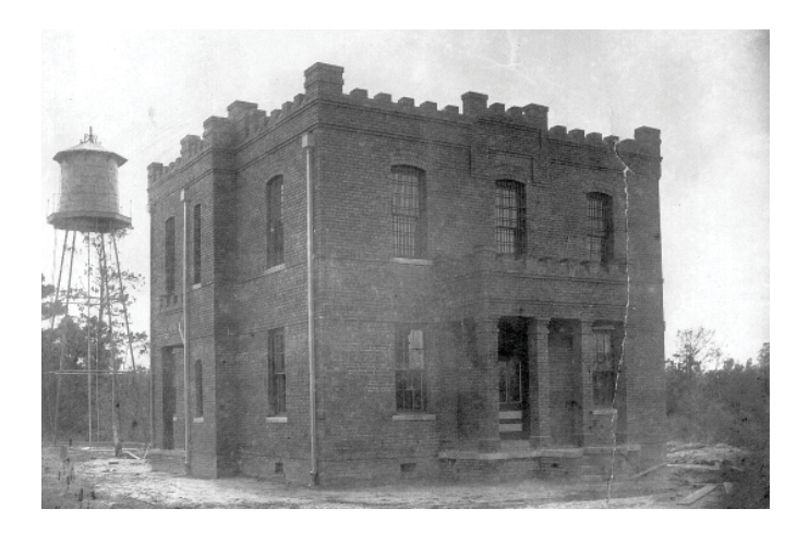
Pictured above is the third Horry County Jail, built in 1908. It was located on the south side of Second Avenue, behind the 1908 courthouse.

Pictured above is the second Horry District "Gaol", built 1825-28. It was located on Main Street on the south side of Scarborough Alley.