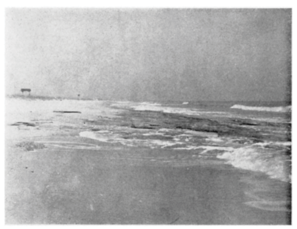
FIG. 6. Hurl Rock Beach, one mile southwest of Myrtle Beach, S. C. March 4, 1940. Exposure of coquina at the ocean's edge.

Many of the "older" citizens of Horry will remember Hearl Rocks. This beloved historc outcropping of rocks, mentioned in diaries from the 1700's, is no longer to be found along our seashore in Myrtle Beach. Was it simply covered with sand during one of the "Beach Renourishment" projects, or was it crushed and leveled by the massive bulldozers? For hundreds of years it was a place of wonderment and beauty to locals and visitors, yet it seems to have vanished without a mention. If you know exactly what happened to this historic natural feature please let us know. Also, if anyone has good pictures of the rocks at low tide, please share those pictures with us so that at least the images of that historic site can be preserved. Email: HorryCountyHistoricalSociety@gmail.com